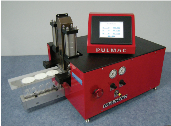
Automated Z-Span™ Tester